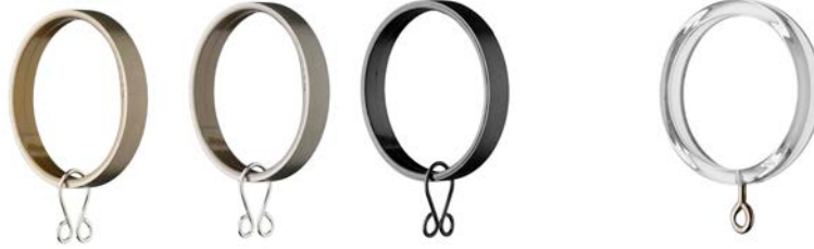
Aluminum Ring HDW20460 Bronze-46, Titanium-11, Graphite-8