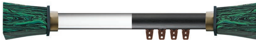
Exotica Wedge HDW20448-358 Malachite