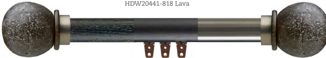
Stone Ball Finial HDW20441-818 Lava