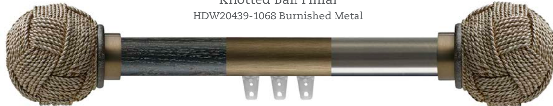
Knotted Ball Finial HDW20439-1068 Burnished Metal