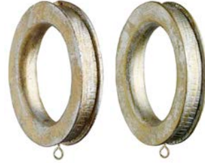
Stardom Ring HDW20446 Gold Dust-4, Dusted Silver-11