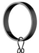
Aluminum Ring HDW20460-8

Due to the natural materials used, slight variations in color may occur from piece to piece. Suggested Pole finishes are listed with each finial above. The Wood and Metal Poles 1 3/8" dia. (not shown) can also be used. For all options and ordering information on Poles, Rings, and Brackets available refer to pages 14-15 or price list. Photography is, at best, a representation of color. Actual finishes may vary slightly.