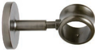
Metal Bracket *HDW20338