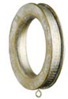
Stardom Ring HDW20446-11