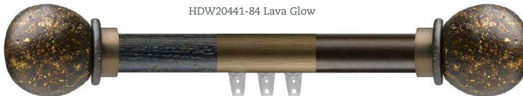
Stone Ball Finial HDW20441-84 Lava Glow