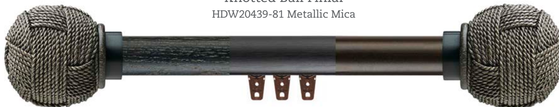
Knotted Ball Finial HDW20439-81 Metallic Mica