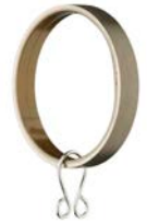
Aluminum Ring HDW20460-46