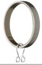
Aluminum Ring HDW20460-11