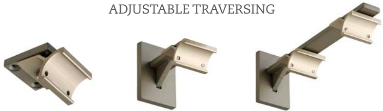
Ceiling Mount HDW20457