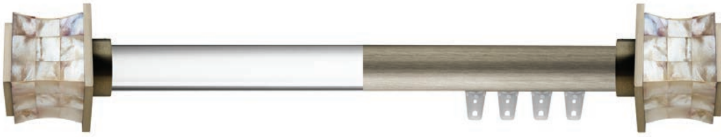
Islandia HDW20450-1 Pearl