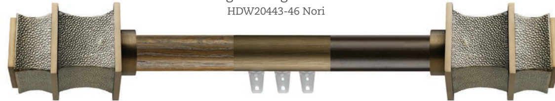
Shagreen Pagoda Finial HDW20443-46 Nori