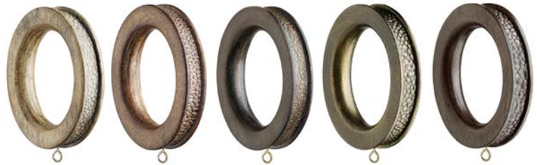
Shagreen Ring HDW20444 Miso-16, Soy-616, Ming-811, Nori-46, Lacquer-818