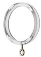
Deco Ring HDW20472-01