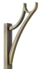
Bracket HDW20413-44 Antique Brass