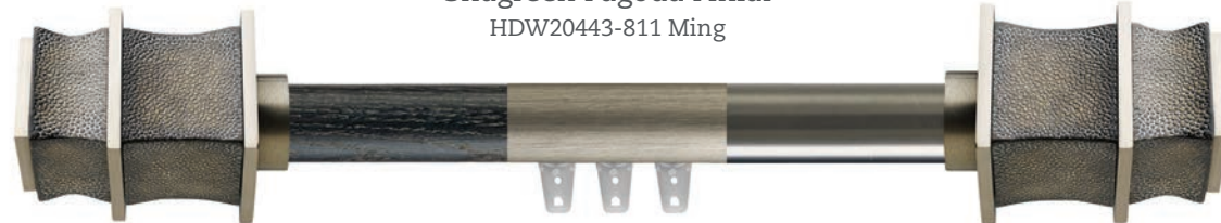
Shagreen Pagoda Finial HDW20443-811 Ming