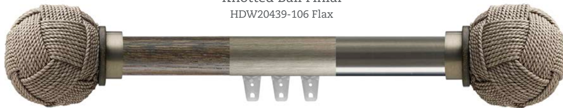
Knotted Ball Finial HDW20439-106 Flax