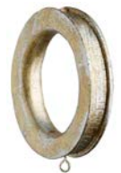
Stardom Ring HDW20446-4