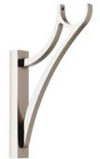
Bracket HDW20413-11 Polished Nickel