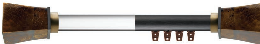
Hawkbill Wedge HDW20449-646 Tortoise