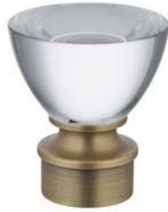
HDW20411-44 Antique Brass