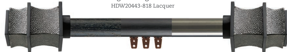
Shagreen Pagoda Finial HDW20443-818 Lacquer