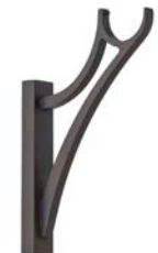
Bracket HDW20413-66 Bronze