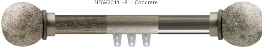
Stone Ball Finial HDW20441-811 Concrete