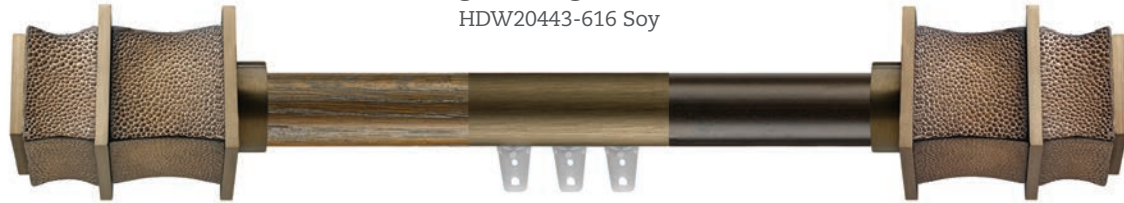
Shagreen Pagoda Finial HDW20443-616 Soy