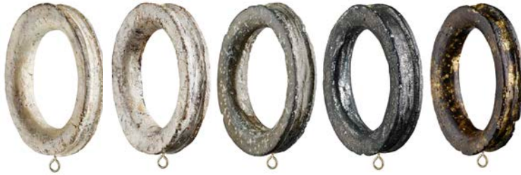
Stone Ring HDW20442 Boulder-16, Concrete-811, Burnished Stone-106, Lava-818, Lava Glow-84