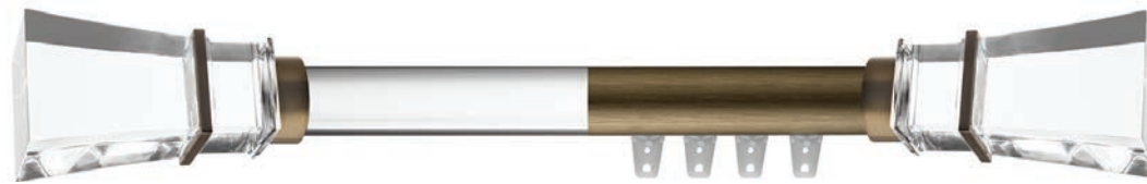
Deco Wedge HDW20447-01 Clear