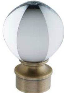
HDW20410-44 Antique Brass