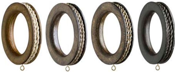
Rope Ring HDW20440 Sisal-16, Flax-106, Burnished Metal-1068, Metallic Mica-81