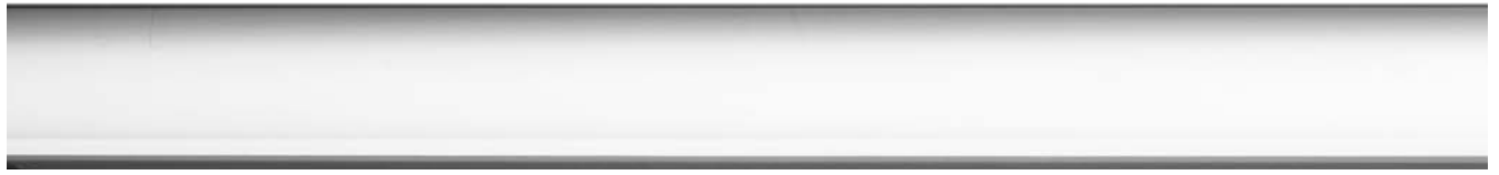
HDW20431-01 Clear -4ft HDW20408-01 Clear -8ft