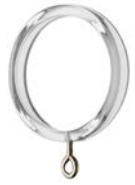
Deco Ring HDW20472-01