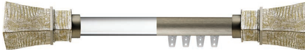
Stardom HDW20445-11 Dusted Silver