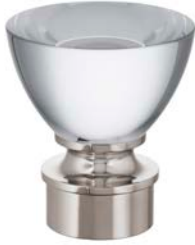
HDW20411-11 Polished Nickel