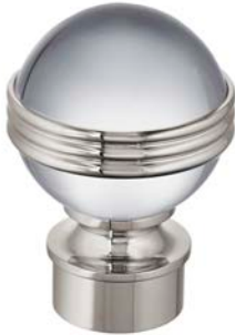
HDW20409-11 Polished Nickel