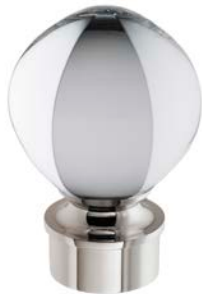
HDW20410-11 Polished Nickel