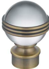
HDW20409-44 Antique Brass