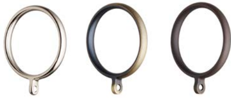
HDW20417-11 Polished Nickel HDW20417-44 Antique Brass HDW20417-66 Bronze