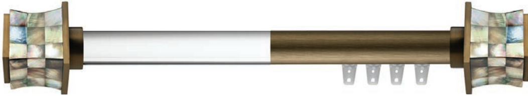
Islandia HDW20450-135 Tahitian