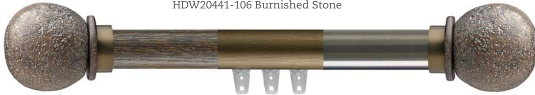
Stone Ball Finial HDW20441-106 Burnished Stone